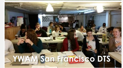
YWAM San Francisco DTS