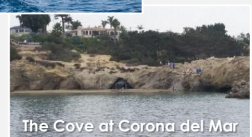
The Cove at Corona del Mar