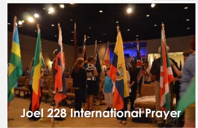
Joel 228 International Prayer