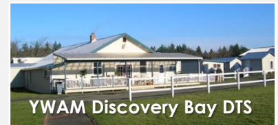
YWAM Discovery Bay DTS

Then there's the myriad of international and missions friends we host as they pass through our area. Hardly a week goes by without re-making the guest rooms. We're sure that we receive much more than we give, and hospitality continues to be one of our favorite ministries!